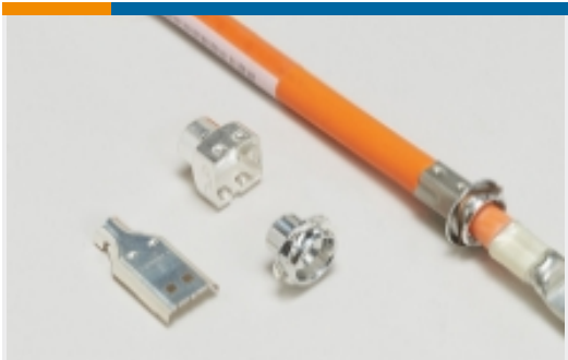
Automotive Connector EMC Shielding (2)