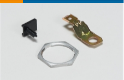
Other Automotive Connector Accessories(13)