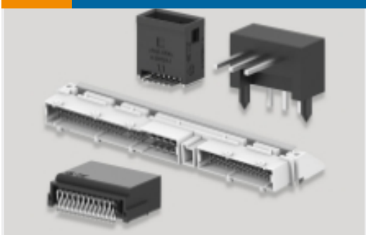
PCB Headers & Receptacles(209)