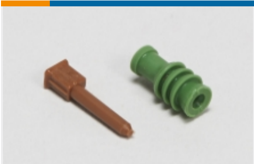
Automotive Seals & Cavity Plugs(26)